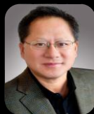
Jen-Hsun Huang Co-Founder, President & CEO NVIDIA