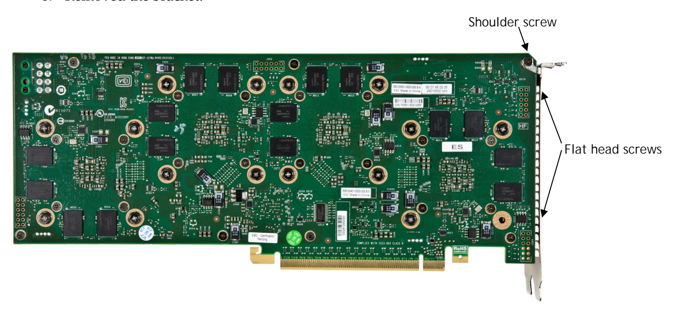
Figure 4. Shoulder Screw and Flat Head Screws Location