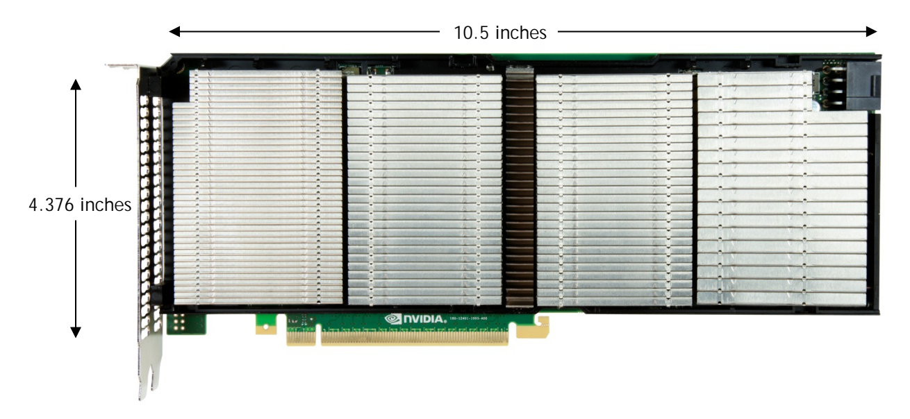
Figure 2. NVIDIA GRID K1 Graphics Board Dimensions

The NVIDIA GRID K1 graphics board conforms to the PCI Express Gen3 ×16 (4.376 inches by 10.5 inches) form factor. Figure 2 shows the NVIDIA GRID K1 graphics board without the top cover installed.