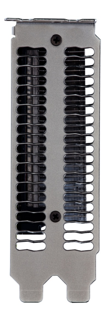
Figure 3. NVIDIA GRID K1 Bracket

The NVIDIA GRID K1 board features a vented bracket, as shown in Figure 3. OEMs who qualify for bracket modifications have the option of receiving modules with no bracket installed.