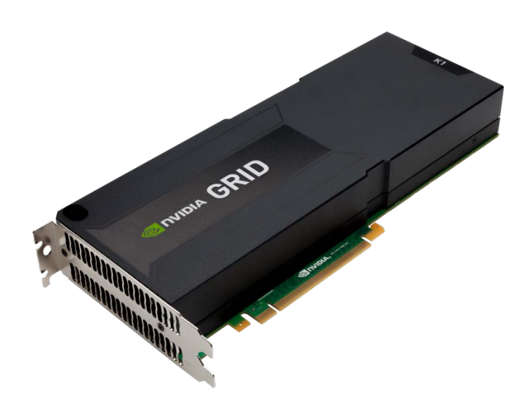
Figure 1. NVIDIA GRID K1 Graphics Board (GK107 / P2401 SKU 502)

The NVIDIA GRID™ K1 is a dual-slot 10.5 inch PCI Express Gen3 graphics board with four NVIDIA Kepler™ graphics processing units (GPUs). The NVIDIA GRID K1 has 16 GB of DDR3 memory (4 GB per GPU), and a 130 W maximum power limit. The NVIDIA GRID K1 graphics board uses a passive heat sink that requires system airflow to properly operate the card within thermal limits. It is designed to accelerate graphics in virtual desktop environments, making it the ideal graphics processor for Microsoft RemoteFX and VMware vSGA.