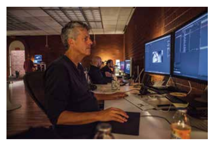
Swordfish Senior Creative Dean Foster designing motion graphics in Adobe After Effects CC with the help of the new Cinema 4D integration

"Both Blackmagic and NVIDIA are helping to remove barriers to entry for small shops like ours," concluded Silverman. "With Resolve leveraging GPU acceleration on a Mac, we can offer color and high-end finishing on a cost effective system. No need for a huge finishing suite. This will really allow us to explore new opportunities without compromising our bottom line."