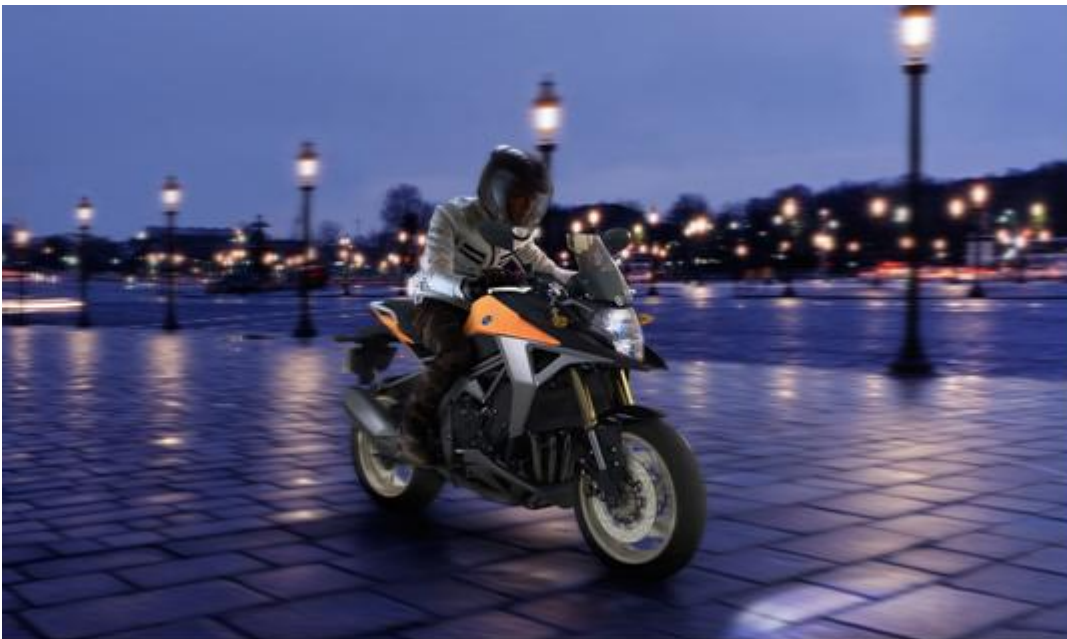
Image courtesy of CLEAT, with 3D Design by Jiro Katayama; CGI Direction by Takuma Hashimoto (CLEAT); CGI design by Shunsuke Nakauchi (CLEAT)

As Yamaha started to engage with CLEAT's Design Clinic service, the team at CLEAT faced a number of challenges in producing high quality 3D graphics that would evoke emotion and reflect features consumers found 'necessary' in market research. The single biggest challenge CLEAT faced in doing this for Yamaha was long rendering times, which made reviews nearly impossible. Yamaha would need to review the shape and color of the product in real time, and CLEAT would need to vary and change it in real time, and rotate the product image 360 degrees in order to review all sides. Unlike marketing/advertising work, which can be rendered as a back-room process, manufacturing work requires near-real time processing. "It was simple," said Yamashita. "We needed tools that would increase our work speed while preserving the quality of our work."