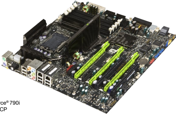
NVIDIA nForce® 790i Ultra SLI® MCP