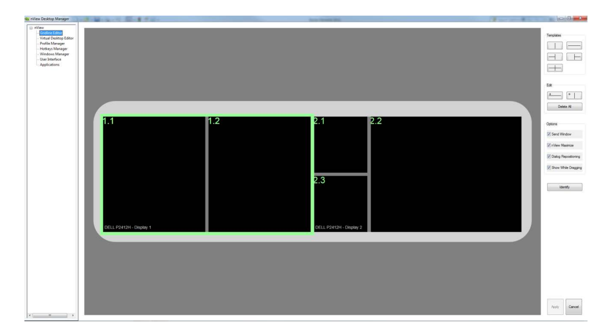
Figure 5. Bird's Eye View Grid