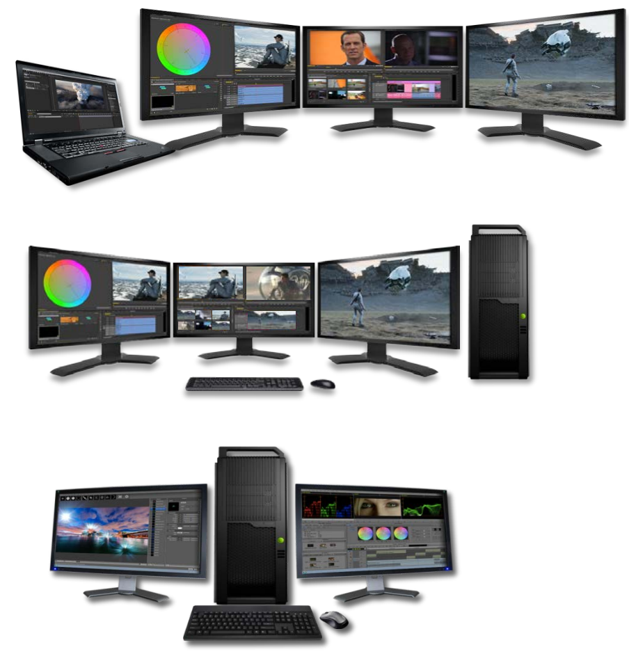
Figure 1. Common Multiple Display Environments

This technical brief provides an overview of the features nView software gives you. For detailed information on how to use nView and its features, please consult the nView User's Guide , available for download from the NVIDIA Web site.