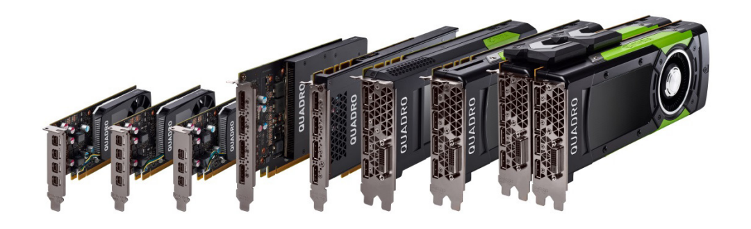
Figure 1. NVIDIA Workstation Graphics Cards

This application note discusses the power requirements of the NVIDIA® workstation products based on NVIDIA RTX™, and Quadro RTX™ line of graphics cards. A suitable power supply is necessary to maintain system integrity under computational load.