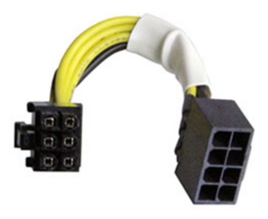
Figure 4. 8-Pin to 6-Pin Adapter Cable

It is possible to split a single 8-pin auxiliary PCIe connector into a single or two 6-pin auxiliary PCIe connectors. If you are using such a splitter, it is important to ensure that the 12V rail on the power supply driving this can handle the additional connector. Refer to the rated amperage on the 12V rail sourcing the splitter to ensure that the connector limits are not exceeded.