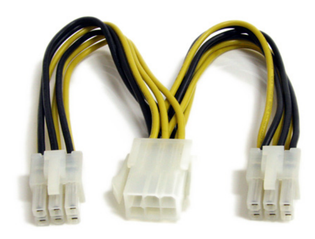
Figure 3. 6-Pin Y-Splitter Cable

It is possible to split a single 6-pin auxiliary PCIe connector into two 6-pin auxiliary PCIe connectors. While NVIDIA does not recommend using the Y-splitter with the Quadro cards, it is extremely important to ensure that the 12V rail on the power supply driving this can handle the additional connector if one must use the splitters.