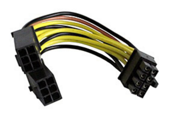
Figure 5. Dual 6-Pin to 8-Pin Adapter Cable

It is possible to combine two 6-pin auxiliary PCIe connectors into a single 8-pin auxiliary PCIe connector. If you are using such an adapter, it is important to ensure that the 12V rail on the power supply driving this adapter is rated for at least 18A.