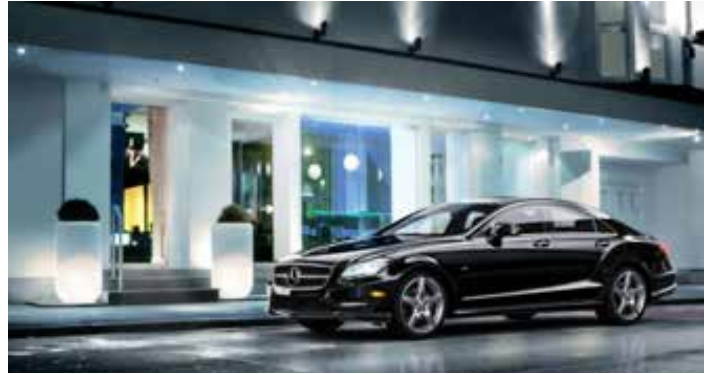
Create stunning photorealistic renderings using 3ds Max and NVIDIA GPUs.

Now, you can render up to 9x faster in 3ds Max using NVIDIA Maximus technology 2 while still working in all your other apps. This makes creating expensive and time-consuming physical prototypes a thing of the past.