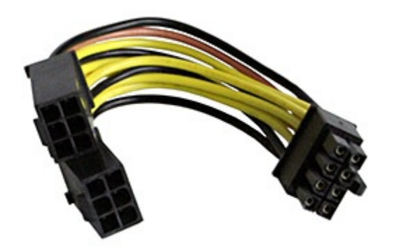
Figure 5. Dual 6-Pin to 8-Pin Adapter Cable

It is possible to combine two 6-pin auxiliary PCIe connectors into a single 8-pin auxiliary PCIe connector. If you are using such an adapter, it is important to ensure that the 12V rail on the power supply driving this adapter is rated for at least 18A.