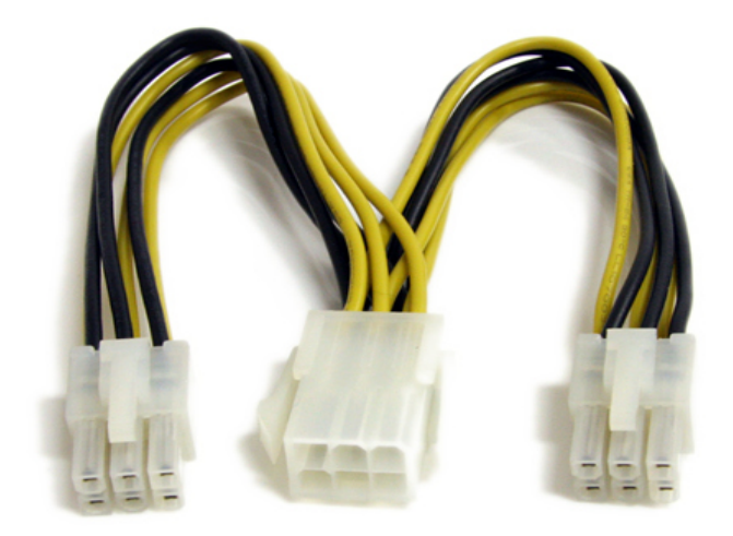
Figure 3. 6-Pin Y-Splitter Cable

It is possible to split a single 6-pin auxiliary PCIe connector into two 6-pin auxiliary PCIe connectors. While NVIDIA does not recommend using the Y-splitter with the Quadro cards, it is extremely important to ensure that the 12V rail on the power supply driving this is capable of handling the additional connector, if one has to use the splitters.