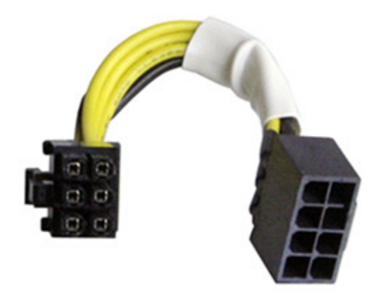
Figure 4. 8-Pin to 6-Pin Adapter Cable

the 12V rail on the power supply driving this is capable of handling the additional connector. Refer to the rated amperage on the 12V rail sourcing the splitter to ensure that the connector limits are not exceeded.