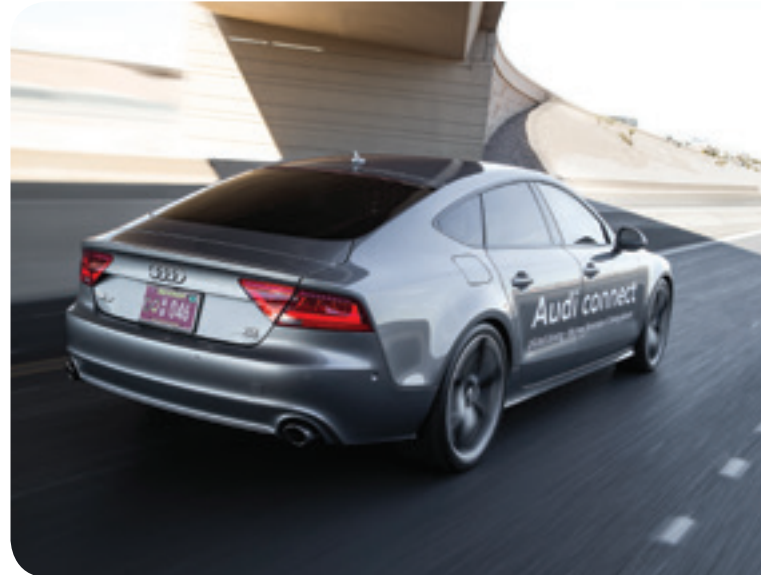
Tegra K1 is the centerpiece of Audi's Piloted Driving capabilities in development including self-parking and traffic jam pilot.

Csongor: We are definitely on the way to a future of automated driving. It will be available to us at different levels of capability in different situations. For instance, in the near term, there will be increasing levels of automated assistance - such as Audi's Traffic jam pilot and self-parking features. Longer term, fully automated or self-driving cars will be available as a service to transport us around in urban or controlled environments, such as closed communities.