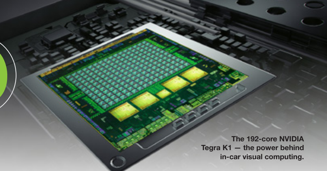
The 192-core NVIDIA Tegra K1 – the power behind in-car visual computing.